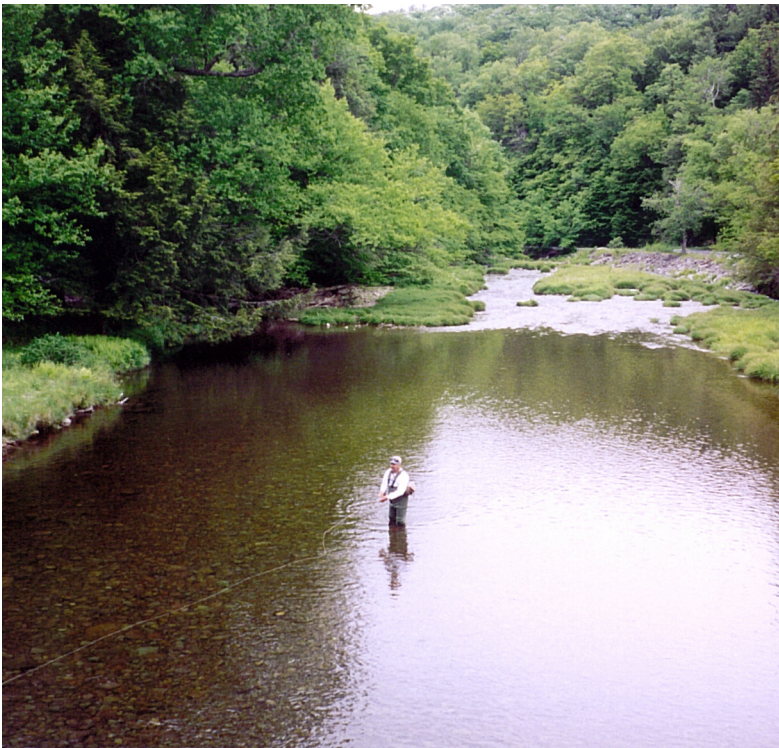
Fisherman on the West Branch of the Neversink